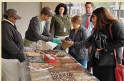
The bakery's 150-pound chocolate bar.