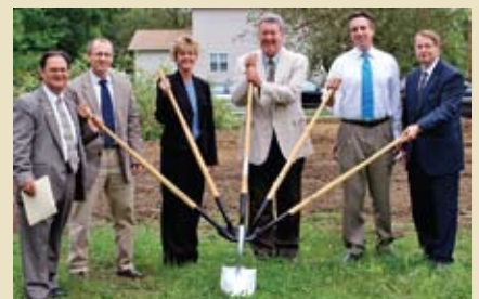
Twinsburg autism home groundbreaking.