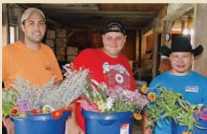
Hattie's Garden at Crown Point.